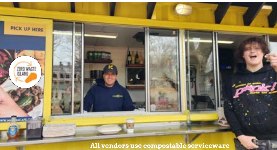
All vendors use compostable serviceware