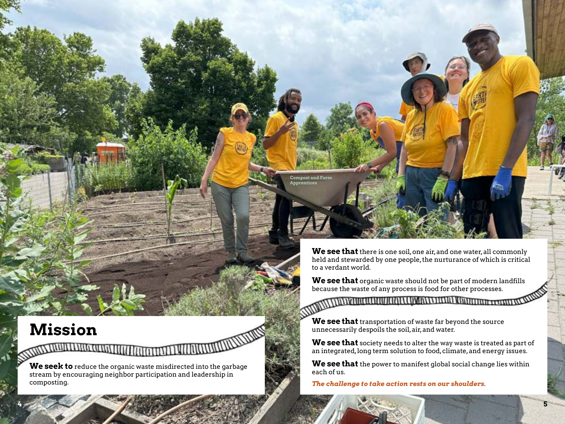
Compost and Farm Apprentices